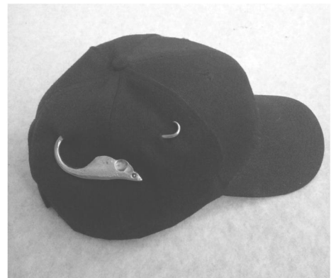
Left—Necklace mouse, extra long tail to put on chain, can also be an ornament mouse. Center— Bottle Opener Mouse, note the "bump" on the rear end of the mouse for bottle opener. Right— Hat Pin Mouse, the tail actually goes through the pre-stitched holes in caps. Below/Right— Clip on the brim type mouse, also in group photo #4